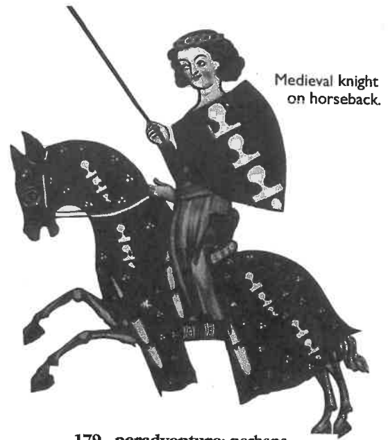
Medieval knight on horseback.