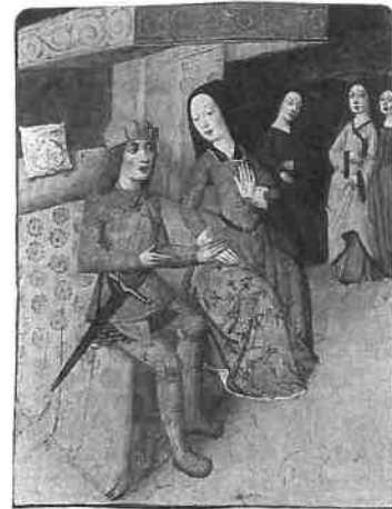
Dijon Library, Dijon, France.