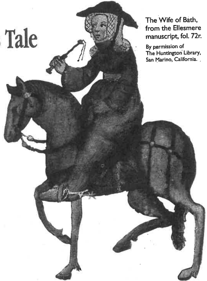
The Wife of Bath, from the Ellesmere manuscript, fol. 72r.