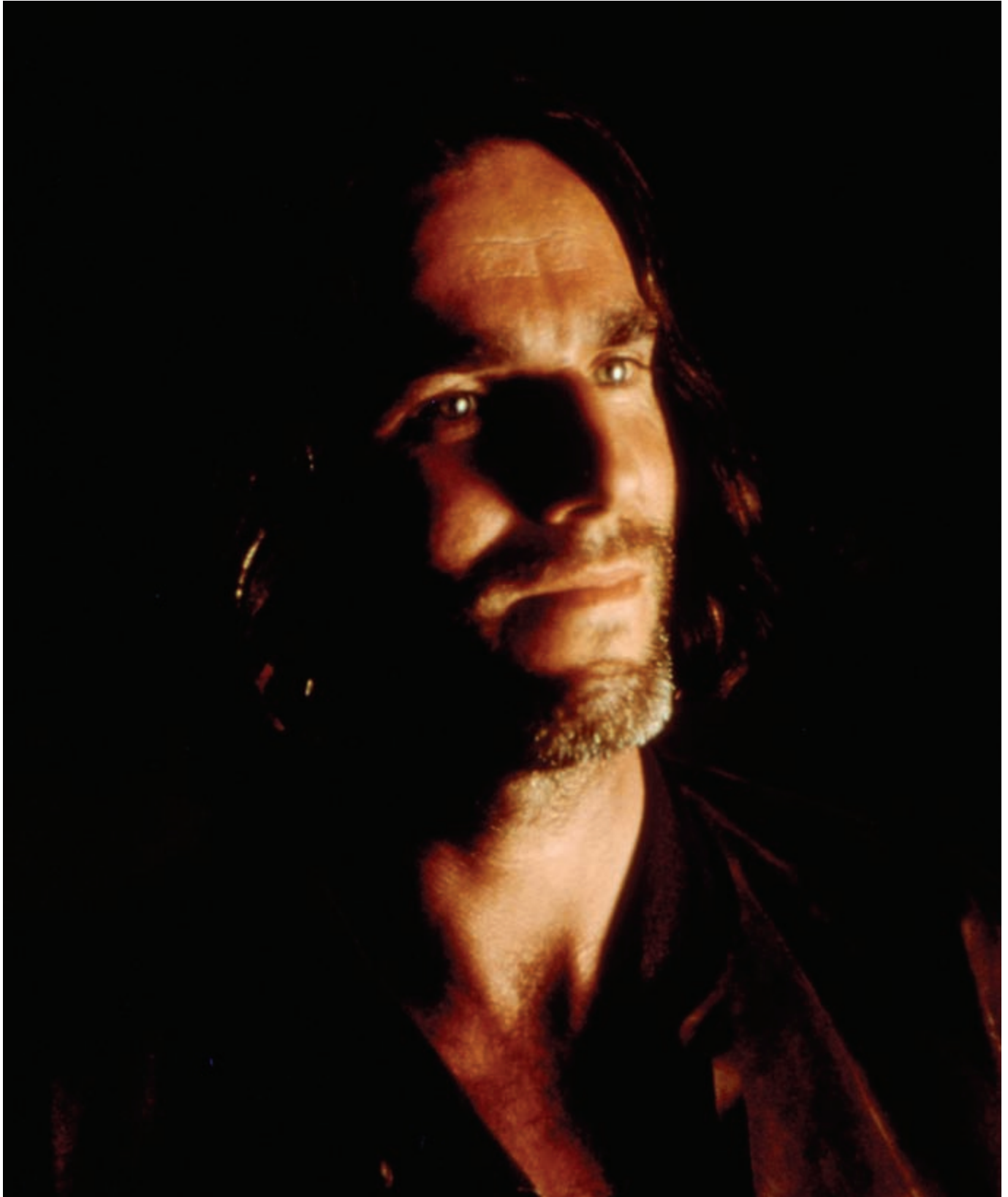
Daniel Day-Lewis as John Proctor