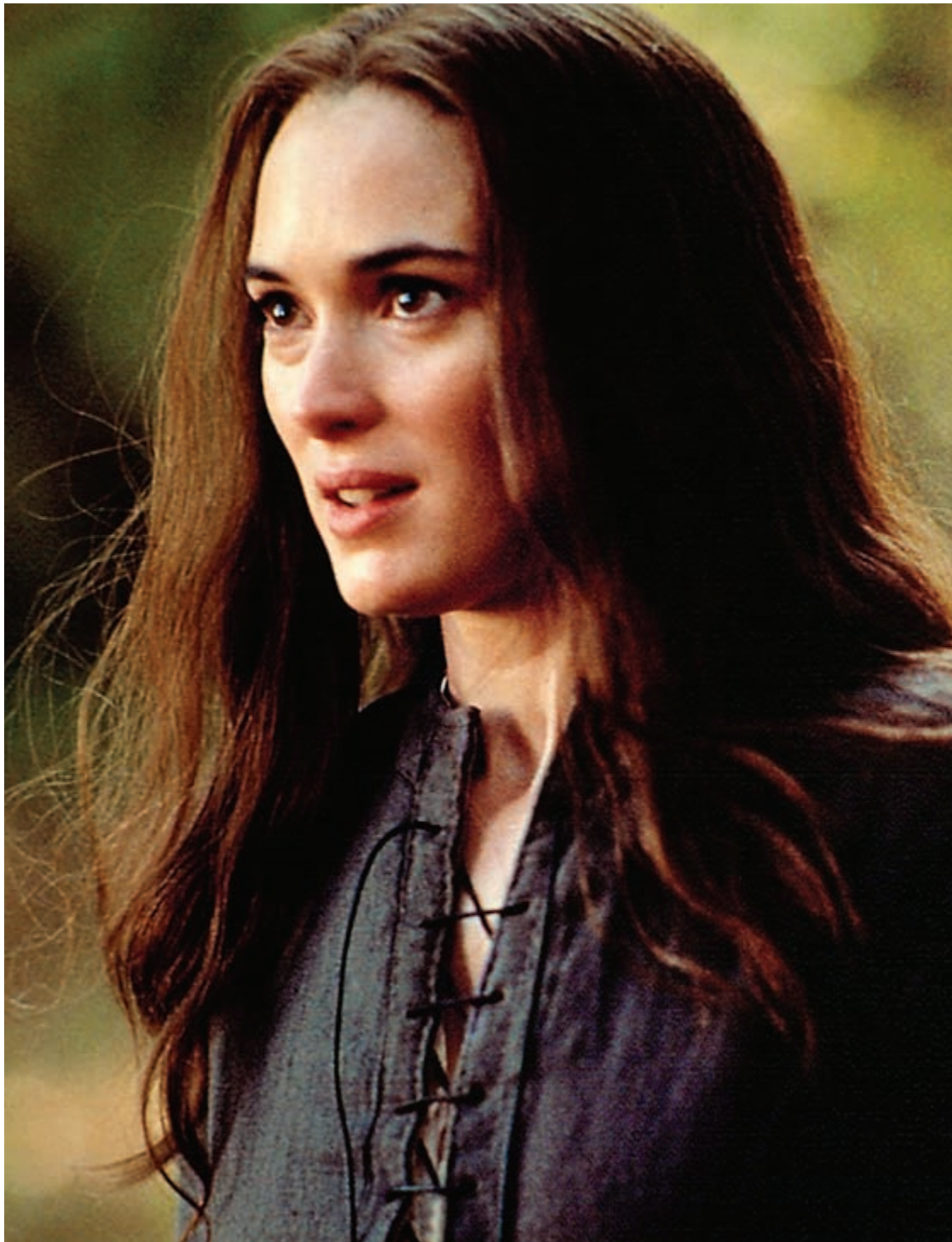
Winona Ryder as Abigail Williams