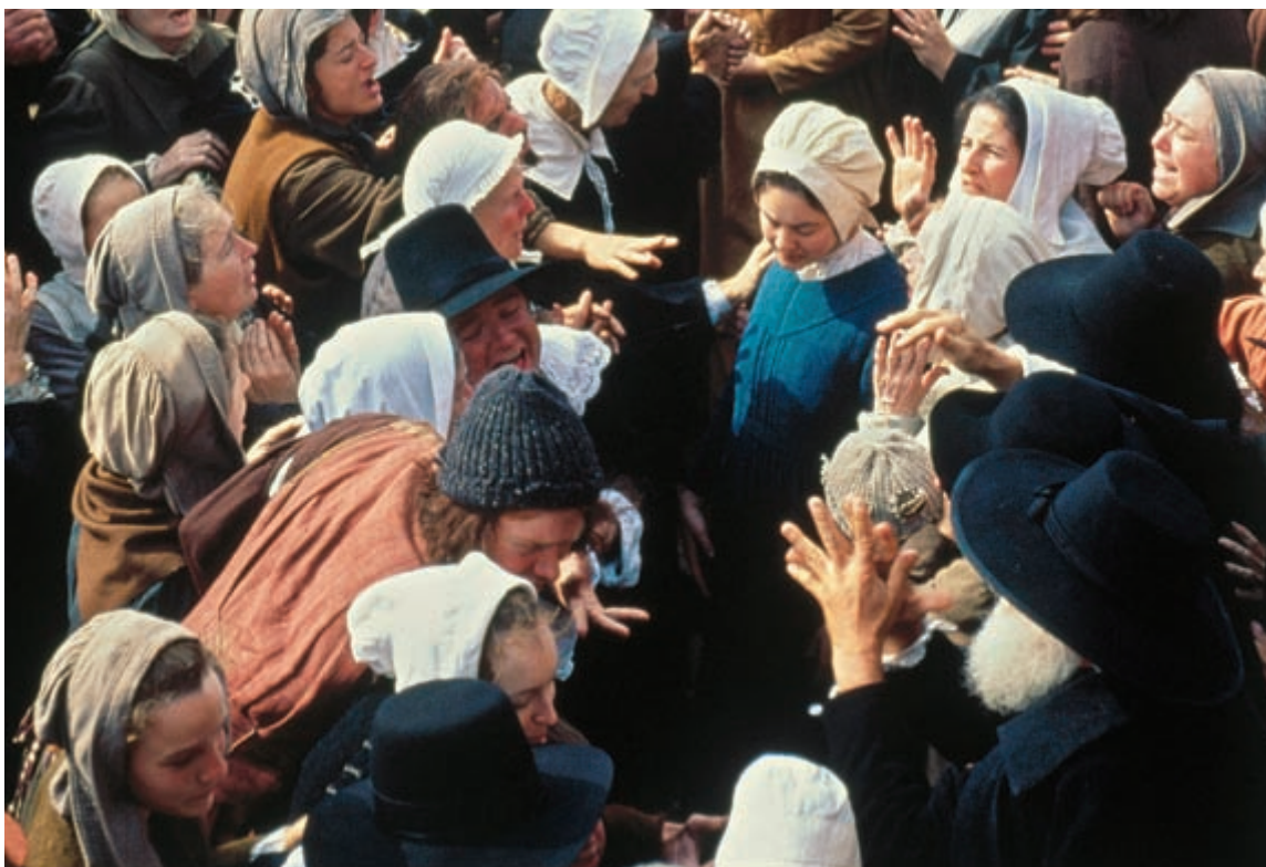
Villagers gathering to gossip

Mary Warren . I never done none of it, Abby. I only looked!