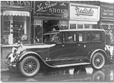
Presidential automobile, ca. 1924 Lincoln

Click on the above link and read through the pages to get an overview of the 1920s. At the bottom of each section, click “Roar” or “Yawn” to advance to the next page; it doesn’t matter which you select.